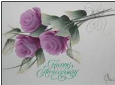
31- Elroy Brick-ey

THANK YOU Jim Travis for all you do to help keep our church building and grounds in good order. You are appreciated! XXOO