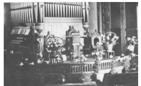
Interior of our church in 1956

Our Organ is 100 years old this month (May). It was built in 1919 by M.P. Moller Organ Company of Hagerstown, MD (which was once the largest pipe organ builder in the United States). After the Methodist church on the corner of Spring and Chapel Streets burned in February 1918, the long abandoned Universalist Church at our present location on the corner of East Main and Green Streets was purchased, extensively repaired and remodeled. The new organ was purchased for $1,750.00 and was installed in May 1919. This new home of the Methodist church was dedicated in June 1919.