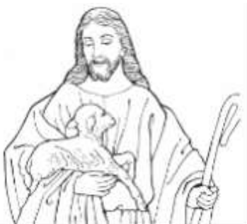
KNOWING JESUS AS THE GOOD SHEPHERD & SHARING THE RISEN CHRIST WITH ALL.