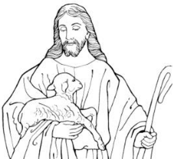
KNOWING JESUS AS THE GOOD SHEPHERD & SHARING THE RISEN CHRIST WITH ALL.