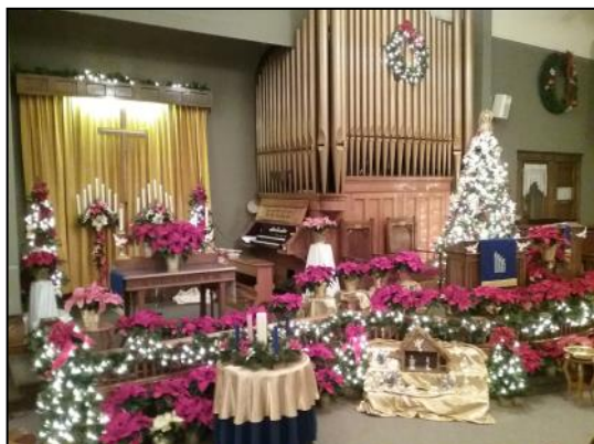
Decorated for Christmas 2018