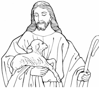
KNOWING JESUS THE GOOD SHEPHERD & SHARING THE RISEN CHRIST WITH ALL