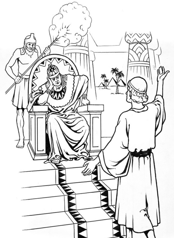
Joseph explains Pharaoh's dream